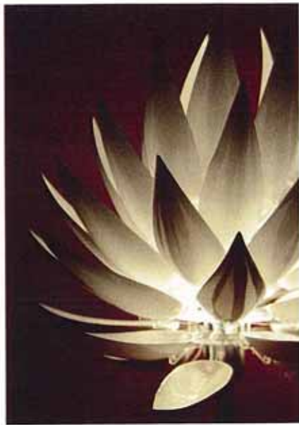
CLOCKWISE FROM LEFT: Jeremy Cole Aloe blossom floor and table lamp 2004-6, porcelain, acrylic and steel, 125 x 45 cm. David Trubridge New koura hanging light shade, 2006, plywood, aluminium 100 x 45 cm. Mark Harrison Gobble bowls made by Husque in Queensland, 2007. Moulded recycled macadamia nut shell and polymer, 22 x 12 cm.